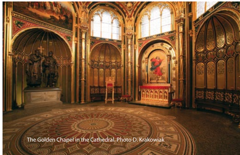
The Golden Chapel in the Cathedral.