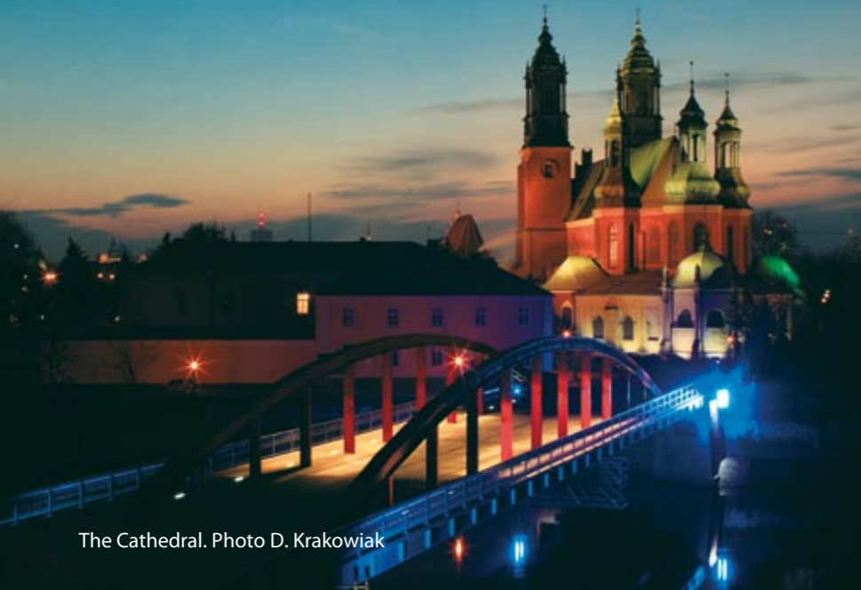
The Cathedral.